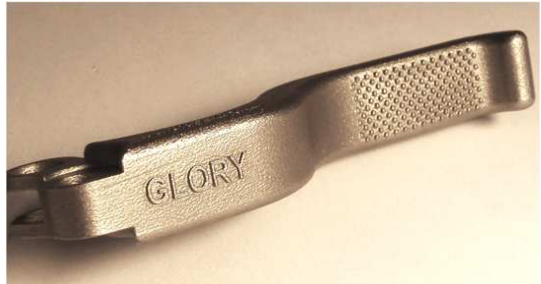
Brake lever built in EOS Titanium Ti64 on EOSINT M 270